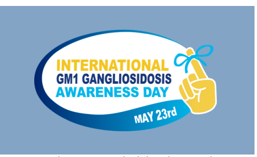
Logo that sits on dark background includes white interior.