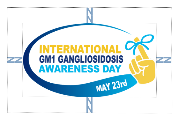
Maintain a whitespace perimeter the equivalent of two of the logo's "N"s around the logo.